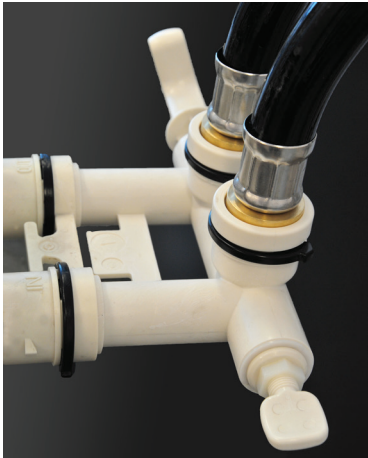
Clip ends: into by-pass